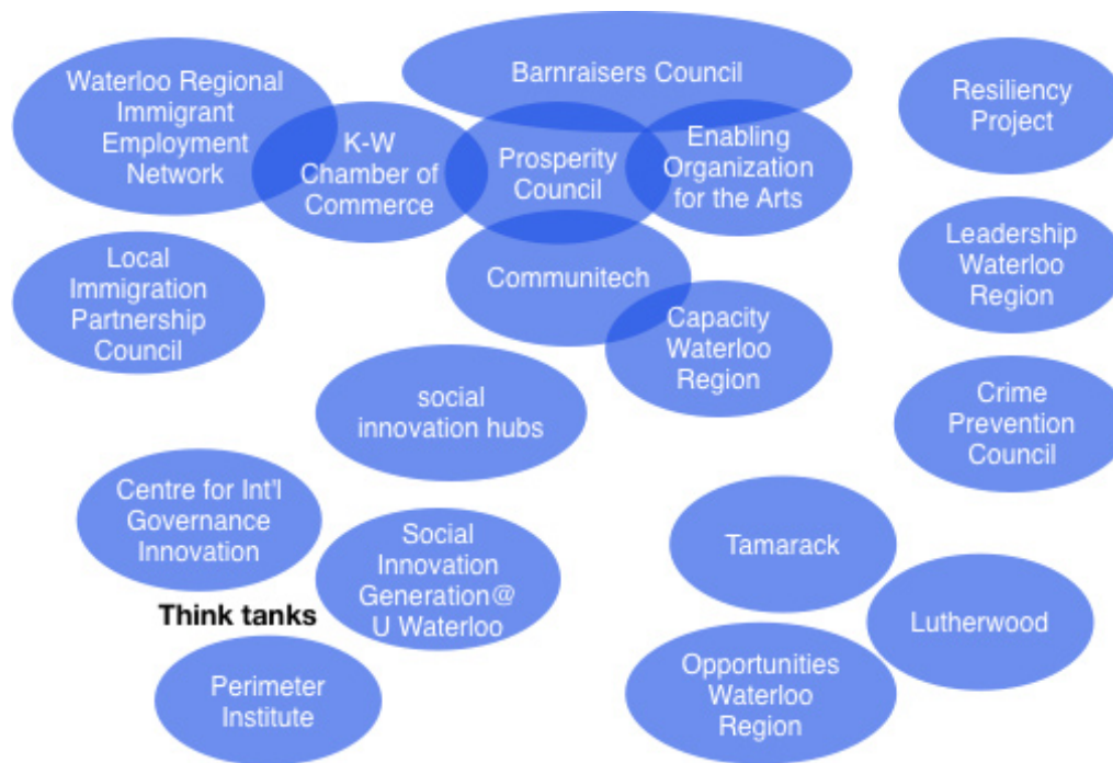
FIGURE 1: Examples of cross-sectoral organizations/networks working in Waterloo Region

As participants and bystanders surveying the landscape, we were at once excited and apprehensive about this sudden emergence of initiatives. While these vehicles for catalyzing change were capturing the imagination of the community, the sheer number of them, and their rapid emergence, precipitated concerns; with so many developing at once, the potential exists to dissipate the focus on real systemic change. Waterloo Region is on the community innovation bandwagon, but the fragmentation of effort causes us to ask: “community innovation to what end?”